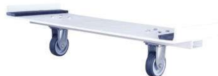
Springboard 2.5 freestanding

This mobile, free-standing diving board is a good alternative to large diving systems. Thanks to a built-in water tank (200 liters), the board has enough counterweight so that even adults can jump on it. However, we recommend that one There should be a water depth of at least 3 m.